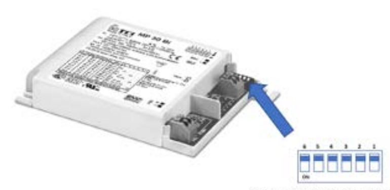
DRIVER DIP SWITCH SETTINGS