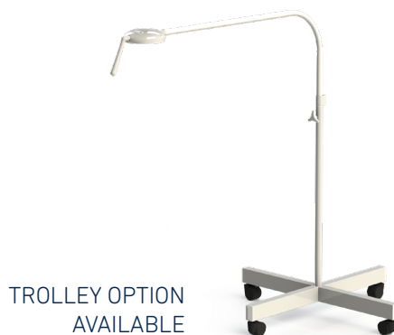
TROLLEY OPTION AVAILABLE

FlexLED is designed and manufactured entirely in Australia and built to conform to and exceed rigorous Australian standards and testing.