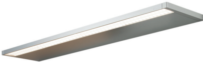
View from below