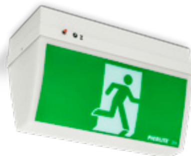
DIRLEDPDSL (Ceiling Mount)