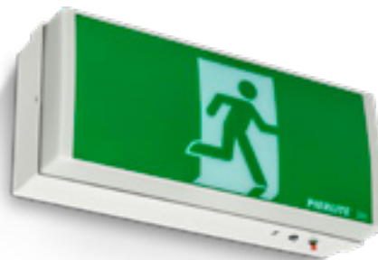
DIRLEDPSSL (Wall Mount)

Ideal for emergency lighting general purpose interior exit luminaire, commercial building or retail.