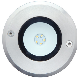
Vienta Round Uplight CIG7860