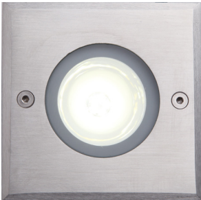
Vienta Square Uplight CIG7830

Compact in design & highly efficient, this light is perfectly suitable for decks & pathways.